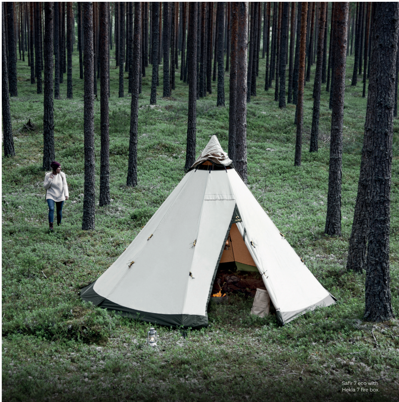
Safir 7 eco with Hekla 7 fire box.